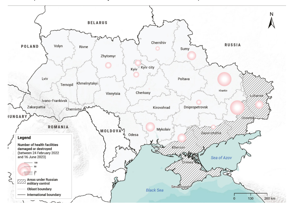
Figure 1. The scale of destroyed and damaged health facilities in each affected oblast (between 24 February 2022 and 16 June 2023)