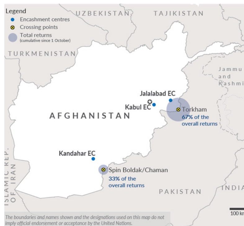
Map 1. Location of crossing points between Pakistan and Afghanistan

Most returnees to Afghanistan passed via the Torkham border crossing in northeastern Afghanistan, connecting Khyber Pakhtunkhwa province of Pakistan with Nangarhar province of Afghanistan, and the Chaman crossing in southeastern Afghanistan linking Balochistan province of Pakistan with Spin Boldak in Afghanistan and, more importantly, the two provincial capitals of Quetta in Pakistan with Kandahar in Afghanistan (Al Jazeera 31/10/2023; RFE/RL 08/10/2023).